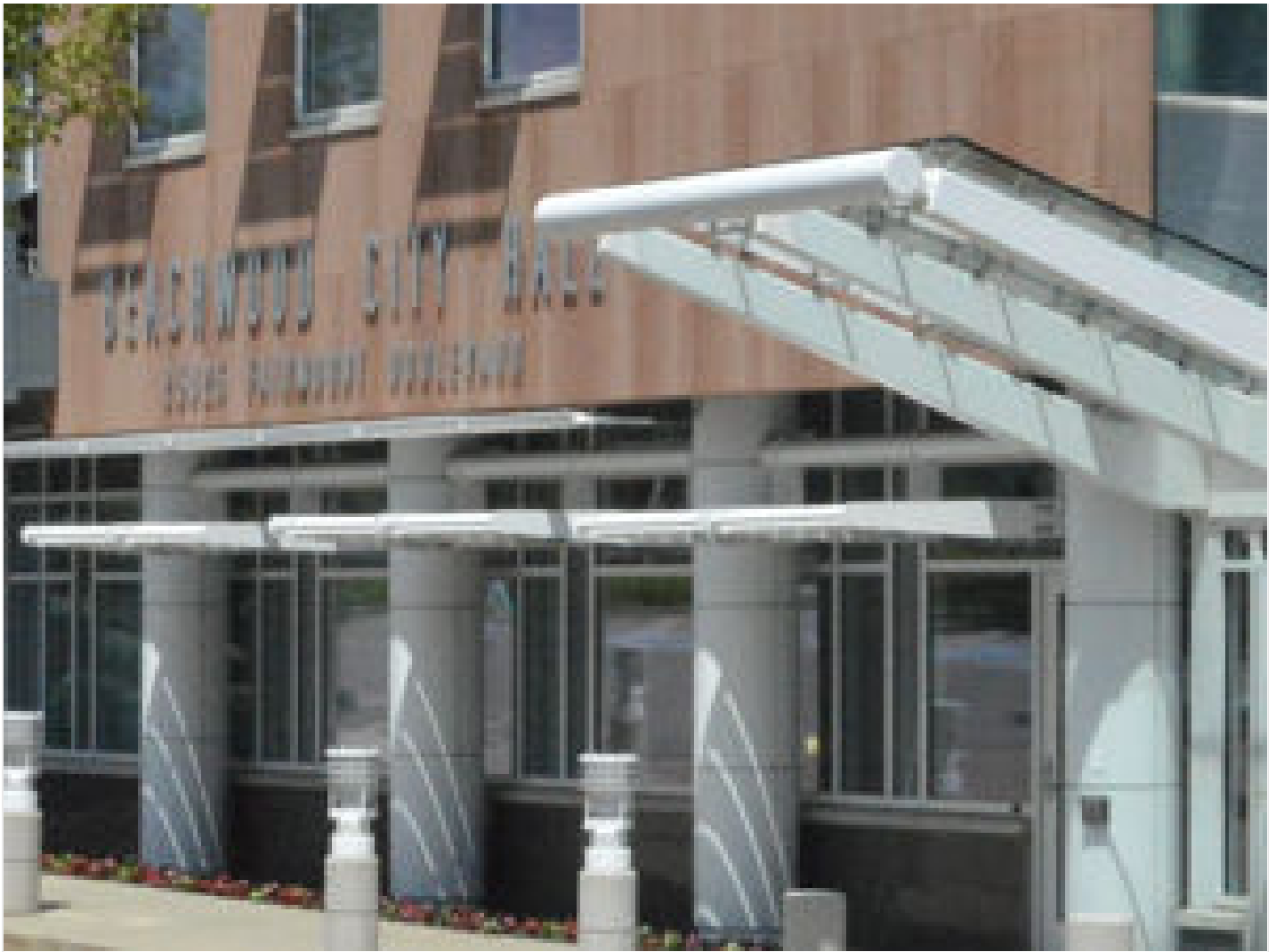
Beachwood proposed zoning updates to include 'places of worship'