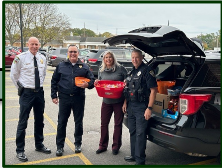
WG Plaza Trick or Treat

We take great pride in and feel a deep responsibility to give back to the community that has welcomed us as one of its own.