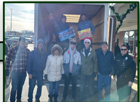
Operation Santa Sleigh