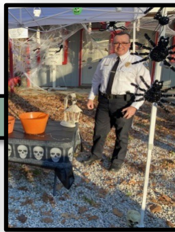
WGRC Trick or Treat Street